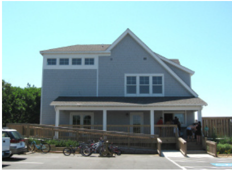
New Club House

Experience living in a preserved natural habitat, an Atlantic Ocean to Currituck Sound community. Nature trails and lakes are easily enjoyed and connect with Audubon Sanctuary. The racquet and swim club overlook the Currituck Sound. A pier and boat ramp make sailing, fishing, kayaking, and windsurfing quickly accessible. The Sanderling Resort & Spa, restaurants and amenities can be reached by a beach walk or bike to Duck's shops and eateries.