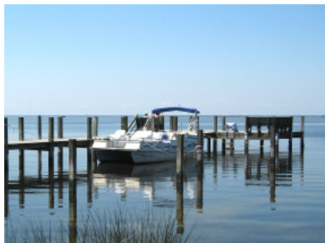
Pier and Boat Dock