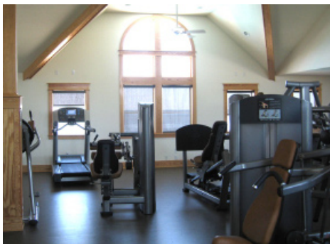
Nautilus & Fitness Equipment